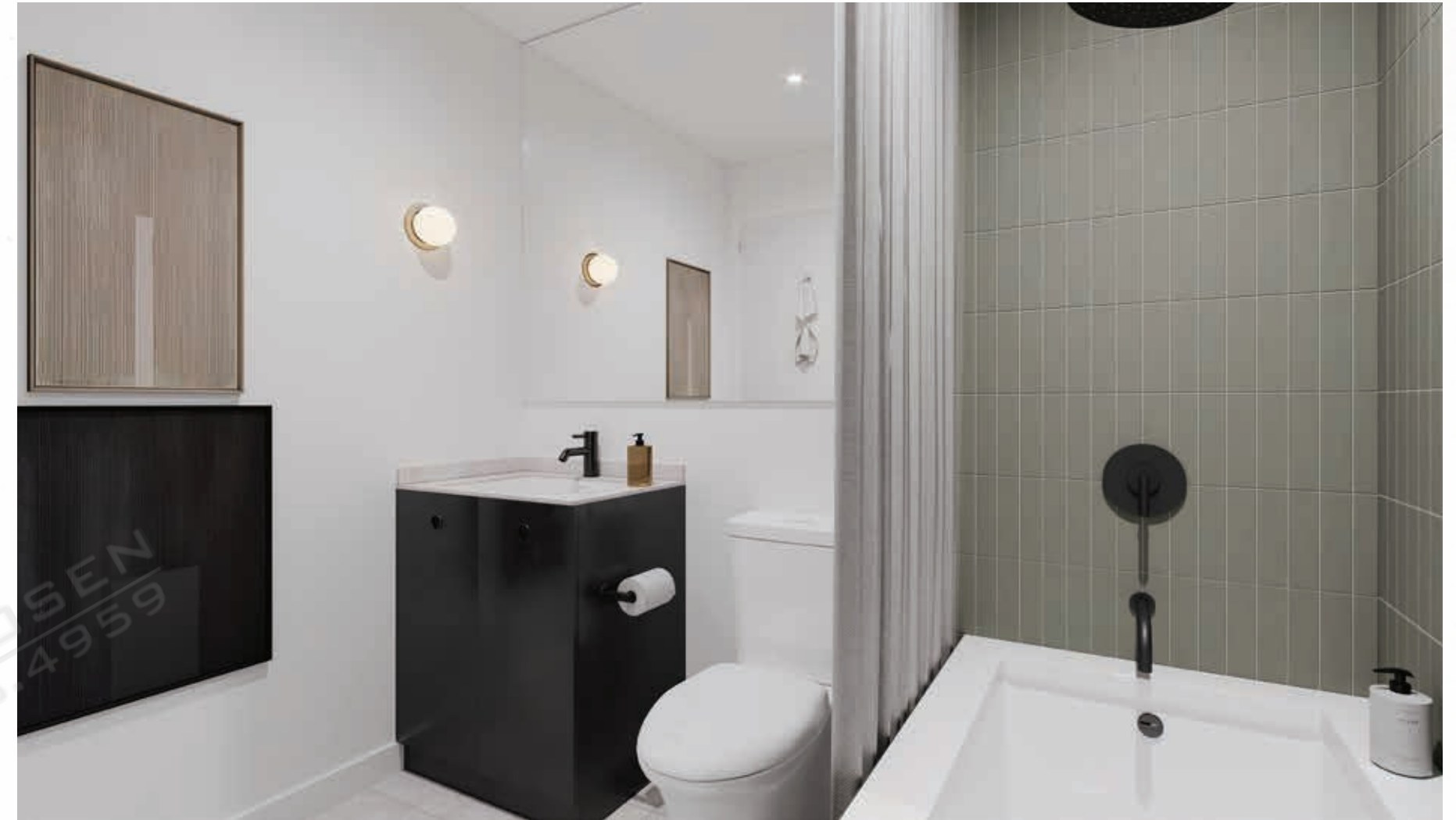
Illustrations are artist's concept only. E. & O.E.