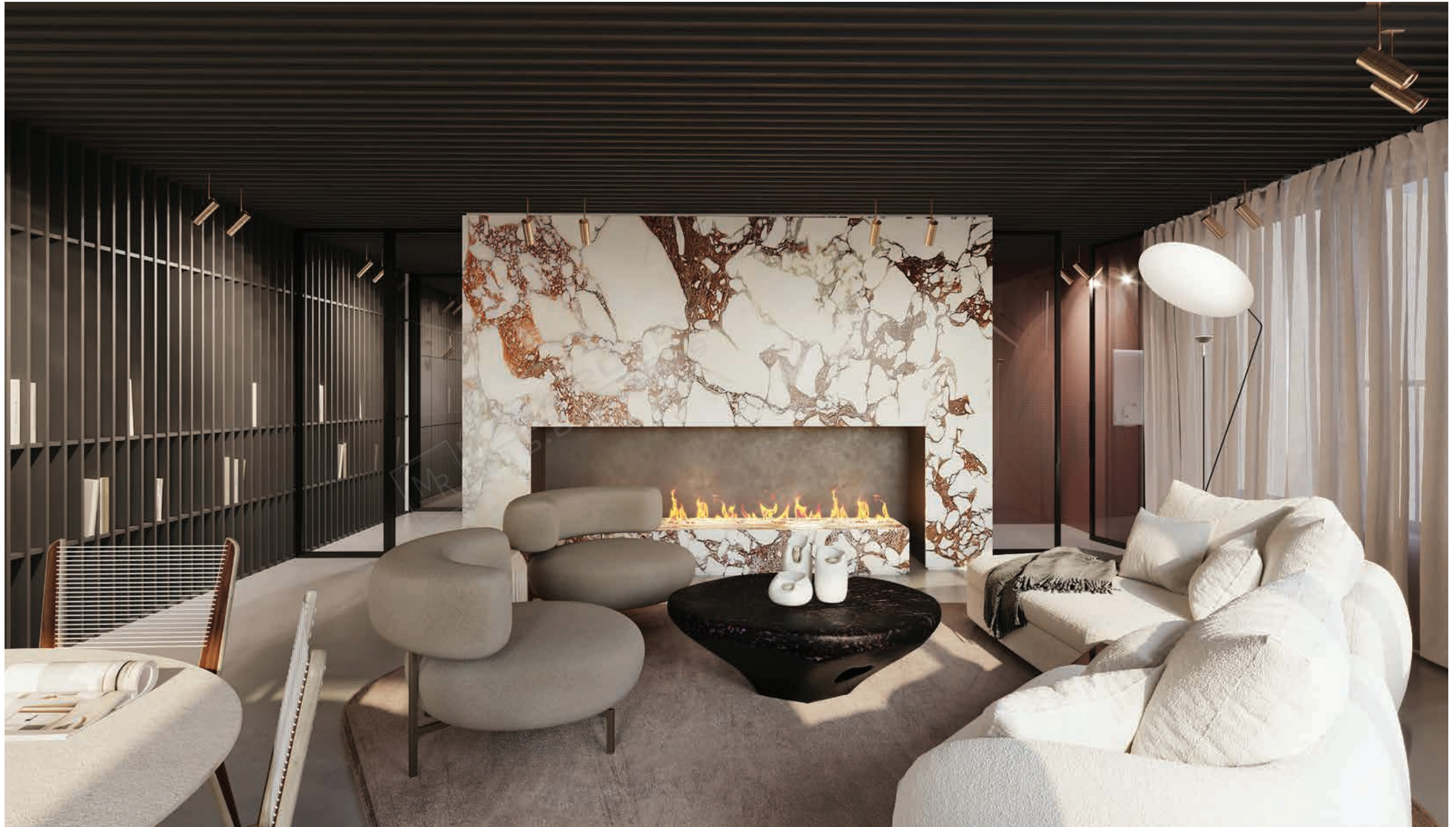
Illustrations are artist's concept only. E. & O.E.

That's a social circle of course. Engage in a stylish environment that says let the celebration begin. Whether cuddled up fireside with friends, lounging on comfy sofas or hosting a cocktail party or epic event, there's space to dine and a convenient catering kitchen to make you the host or hostess with the mostest.