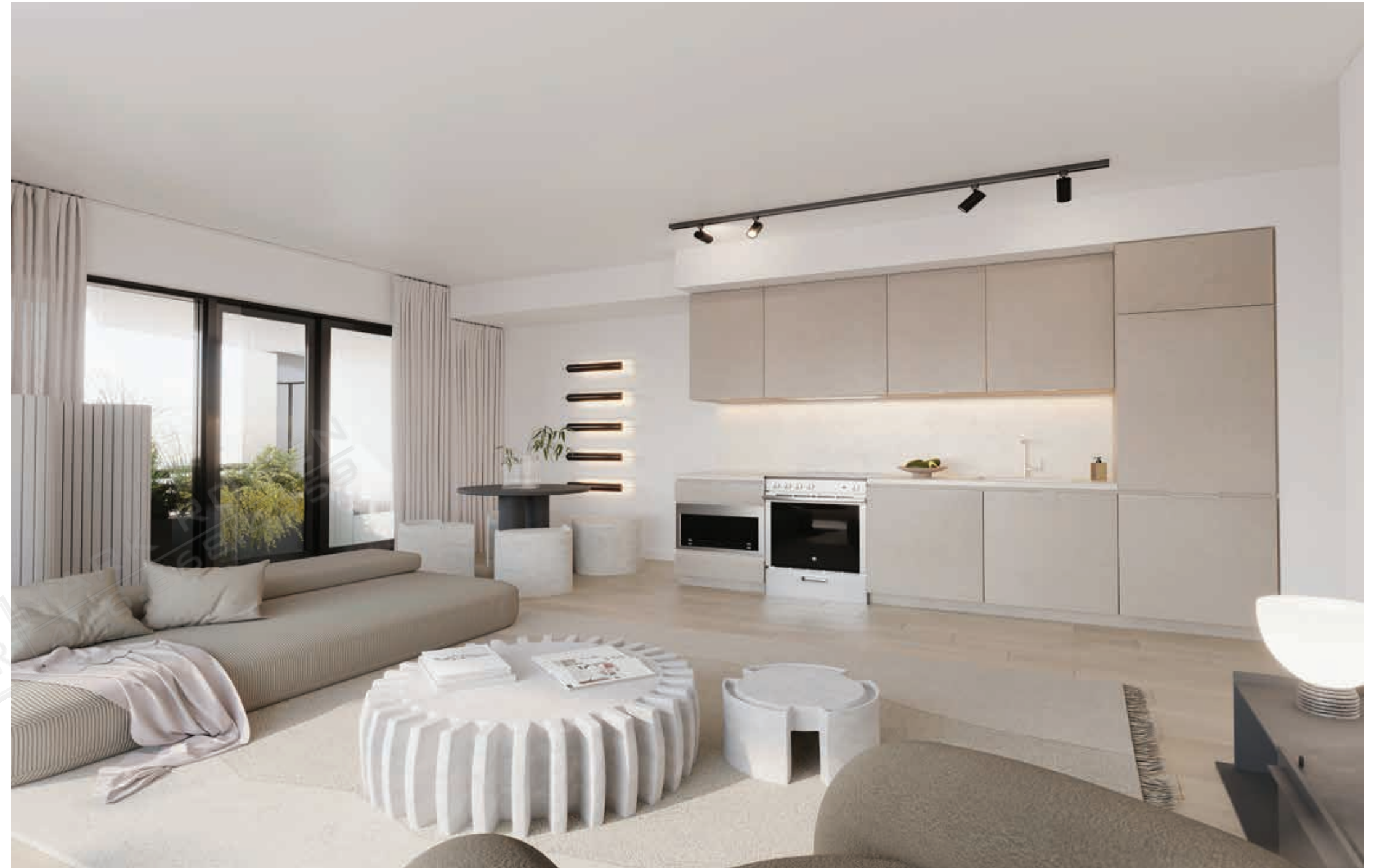
Illustrations are artist's concept only. E. & O.E.