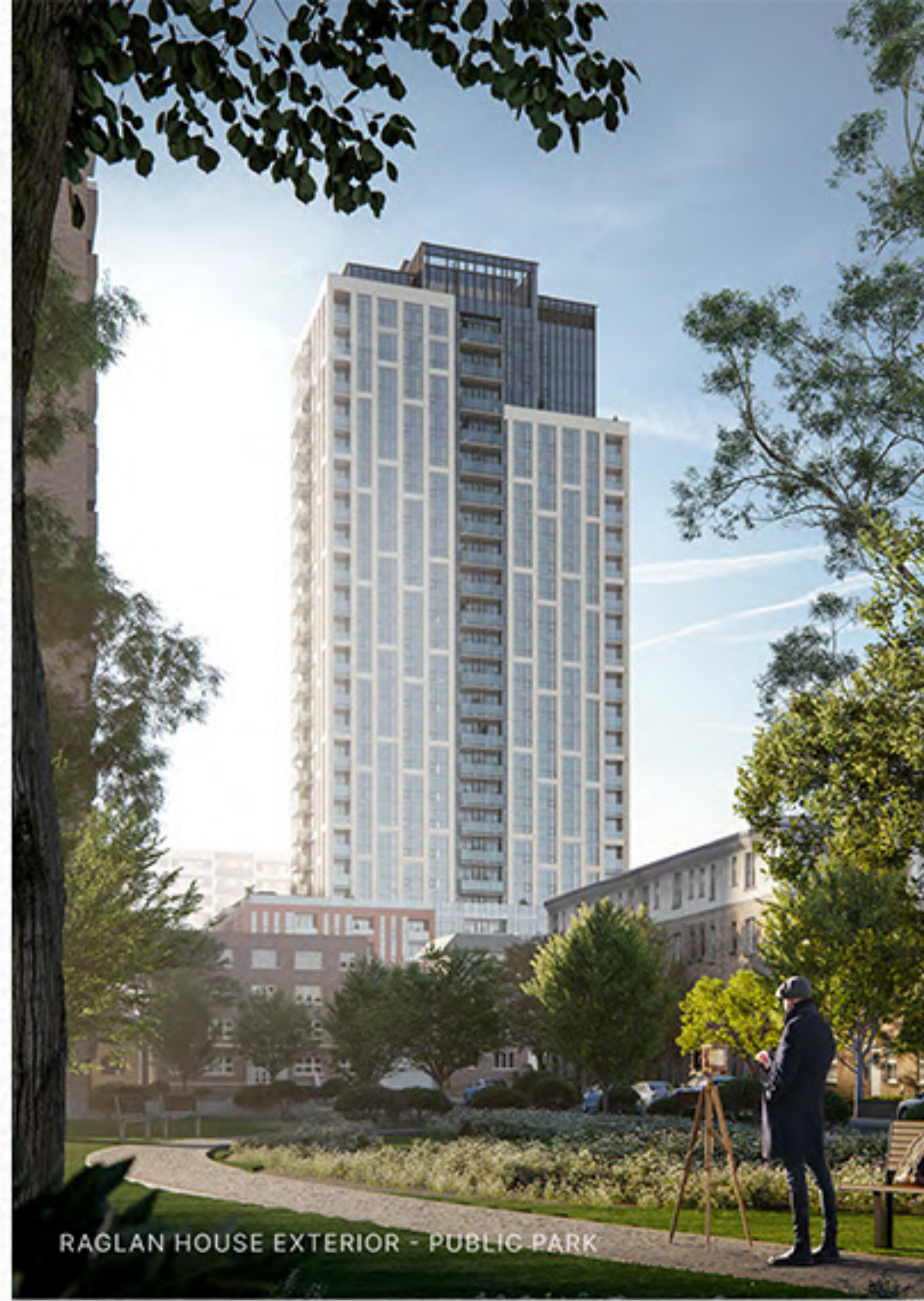
RAGLAN HOUSE EXTERIOR - PUBLIC PARK

..... This affluent midtown neighbourhood has all the perks in place—shopping, dining, transit, access to natural spaces—and it's only getting better.