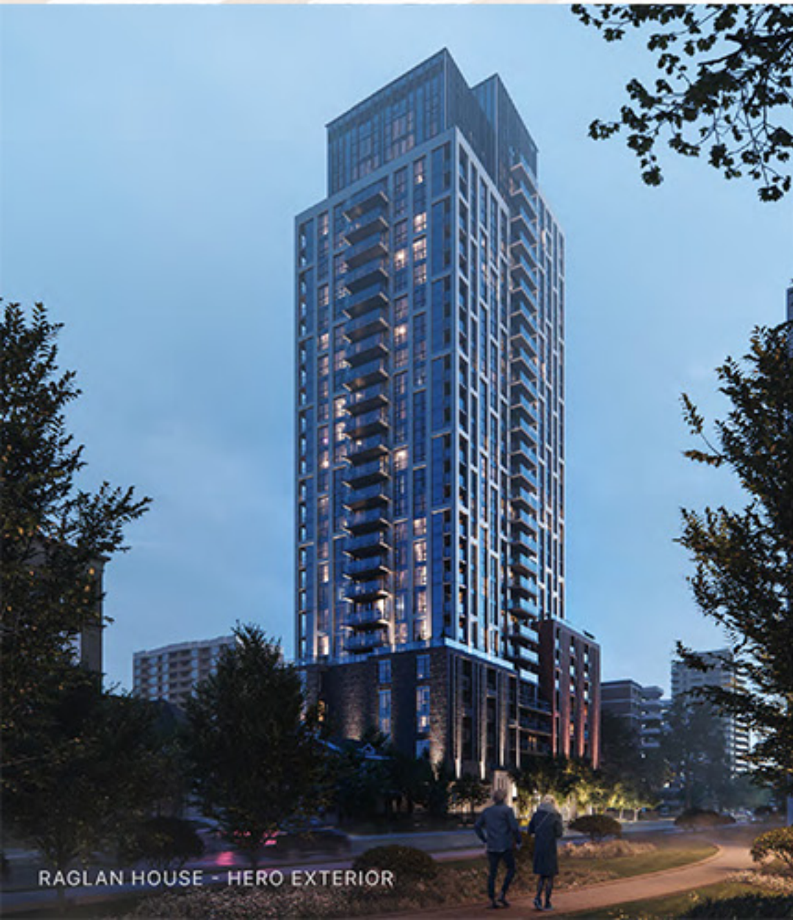
RAGLAN HOUSE - HERO EXTERIOR

..... $4 billion in master-planned growth and enhancement for the immediate area is already under way.